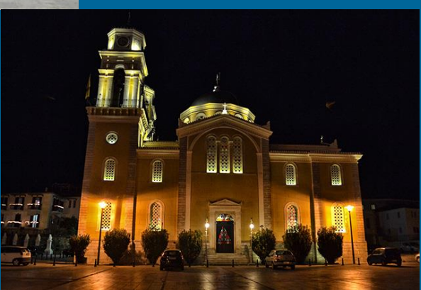
The church of Ypapanti, (The Presentaton of Christ) dominates the homonymous square and is the Metropolitan Church of Kalamata. The present magnificent temple of Ypapanti was founded in 1860 and inaugurated in 1873.

The small church of the Holy Apostles: According to tradition, the Revolution of 1821 was proclaimed in this church.